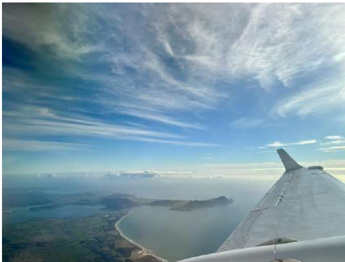
Whangārei Heads and Bream Bay

A recent highlight for our flight team was a repatriation mission, transferring a patient from Dunedin ICU to Whangārei ICU— one of the longest possible hospital-to-hospital flights within New Zealand. The teamwork and preparation required for this transfer provided significant opportunities for our team's growth and professional development.