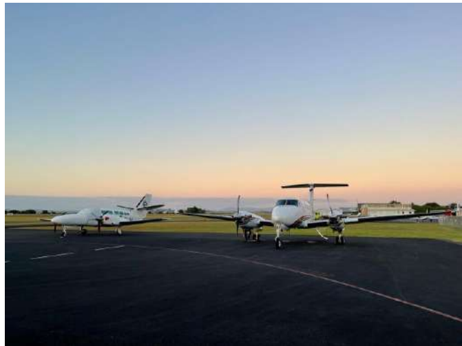
Morning light, Whangārei Airport

Our flight team continues to experience a high volume of transfer requests, and we are currently orientating seven new nurses to our nurse-only fixed-wing transfer service. This team expansion plays a part in ensuring the population of Te Tai Tokerau continues to benefit from access to timely and specialist healthcare across our region.