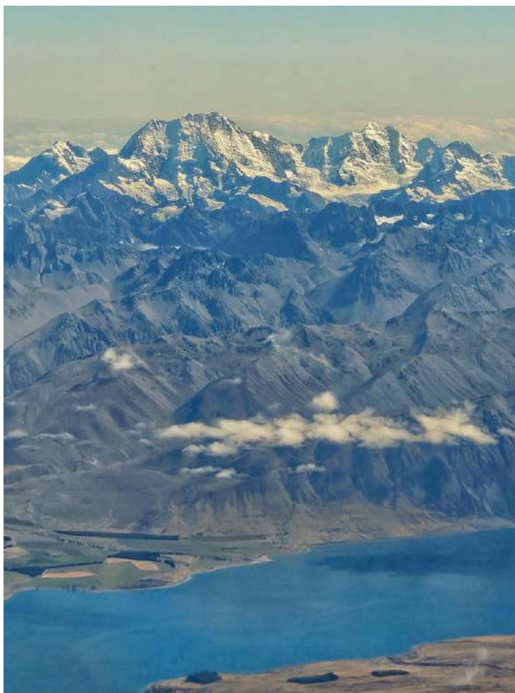
Mount Cook/Tekapo – Kier Escario

We wish you all a happy easter! And may your days be not too chilly just yet!