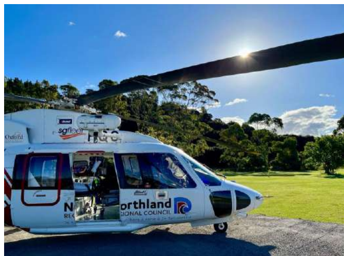
Helimed 4 on a temporary pad at Rawene Golf Course